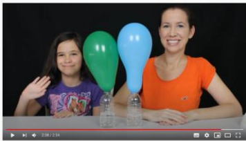
BALLOON BLOW UP! EXPERIMENTING WITH GAS - SCIENCE SUNDAY

https://www.youtube.com/watch?v=bP7xgV07glc&list=RDCMUCkG0mk8MzPJmdHrKqS6vAFw&start_radio=1&t=170