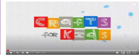
AWESOME DRAWING TRICKS FOR KIDS

Online safety- watch these brilliant articles from Newsround